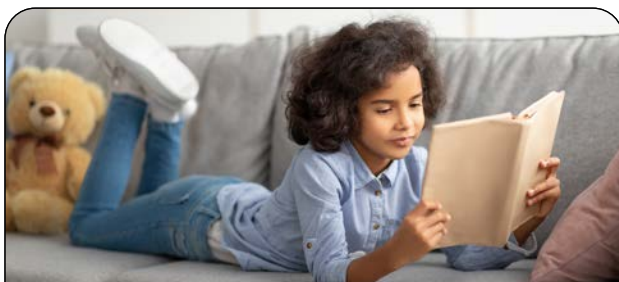
Jenny is _____ a book.